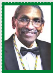
SHERMAN WOODEN EASTERN