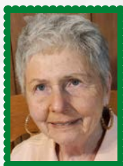
OLIVE STOOPS PAGES