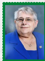
BRENDA GLADFELTER HOUSING